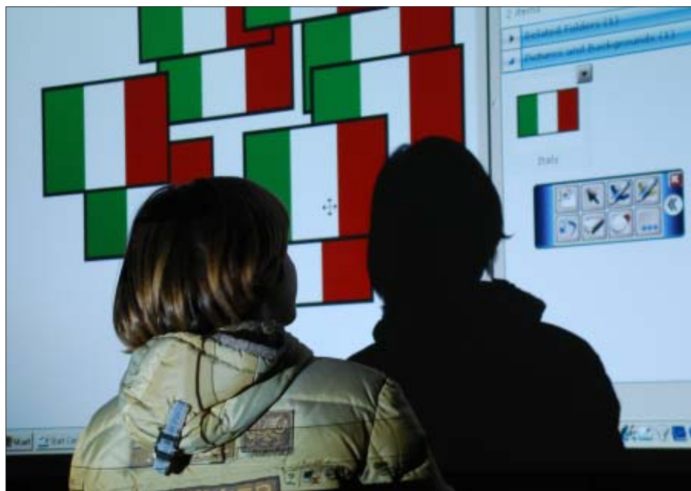
An Italian student from the Carlo Collodi Elementary school in Musigliano, province of Pisa, learns how to use the latest touch screen technology at the Livorno Unit School during a visit March 28.

"As a commander and a father, I believe it's an important opportunity for these children to learn lessons that they don't