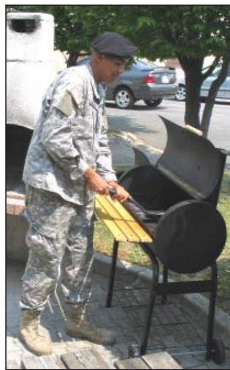
A Soldier carefully cleans up the grill used for a battalion get together.