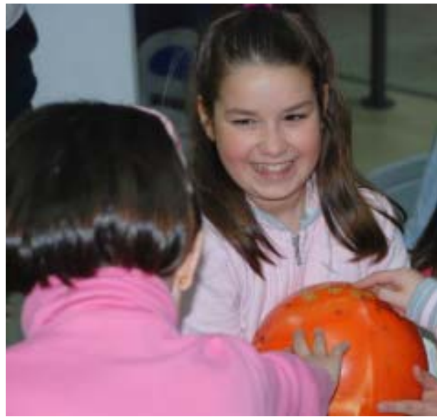
Elementary students from the Carlo Collodi Elementary school in Musigliano, province of Pisa, look over a bowling ball at the Camp Darby bowling alley. The students were on post March 28 for a visit with Livorno Unit School students.